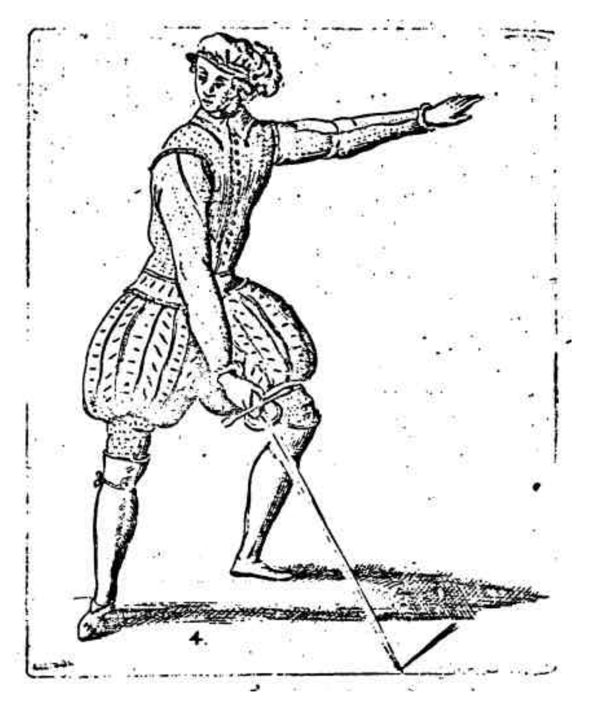
[71V] Quarta guardia larga, difensiva, imperfetta; formed from the full punta sopramano, and from which originates the rovescio ritondo.