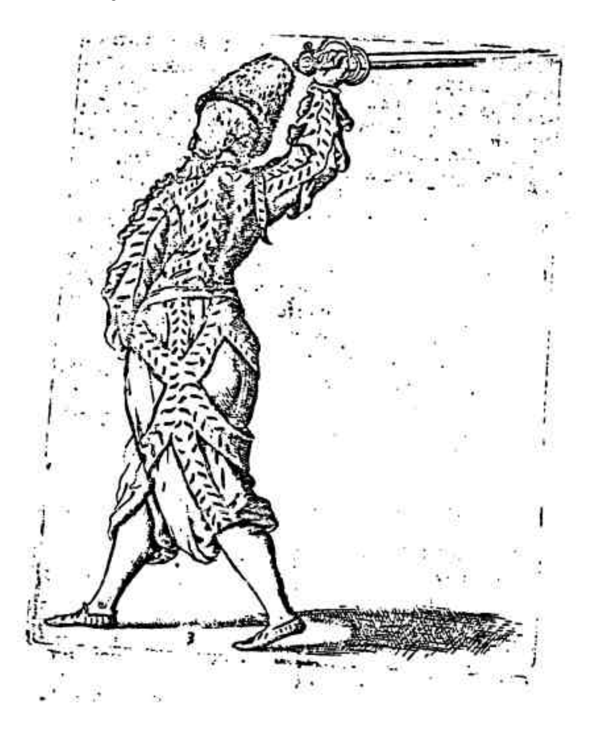
[69V] Terza guardia alta, offensiva, imperfetta ; formed from the rovescio ascendente , from which originates a mandritto descendente , either full or half.