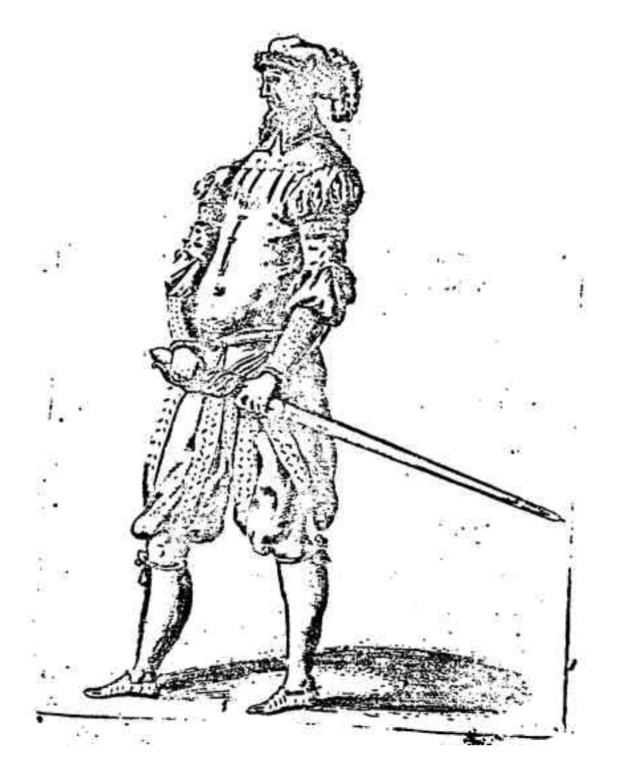
[65V] Prima guardia difensiva, imperfetta ; formed from girding the sword at the left side, from whence originates the rovescio ascendente .