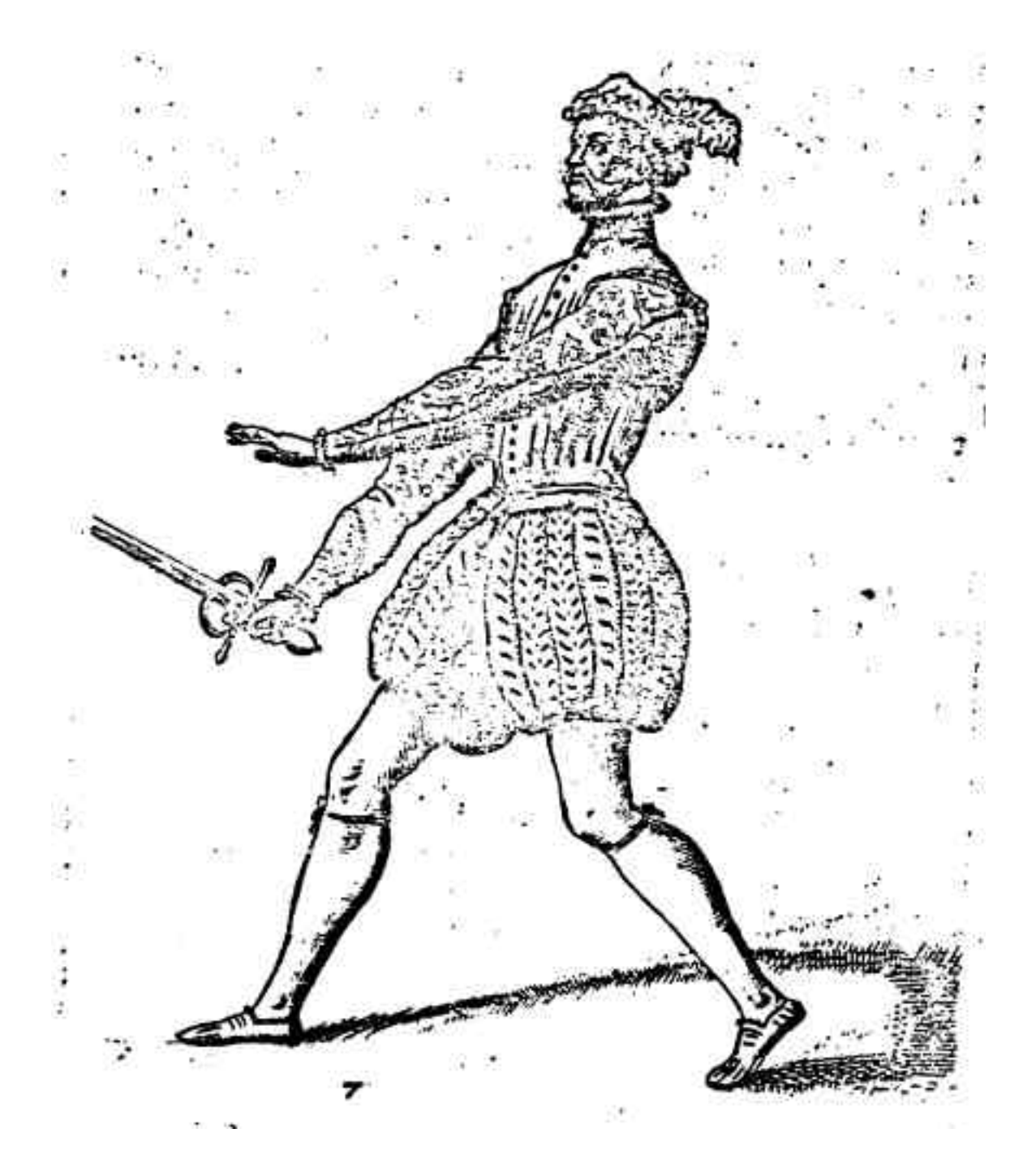
[75V] Settima guardia stretta, offensiva, perfetta , formed from the mezo rovescio difensivo , from which one will be able to reset into guardia alta, offensiva, perfetta .